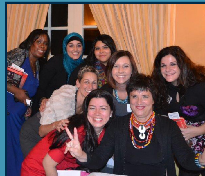
Eve Ensler with Women Aware Staff