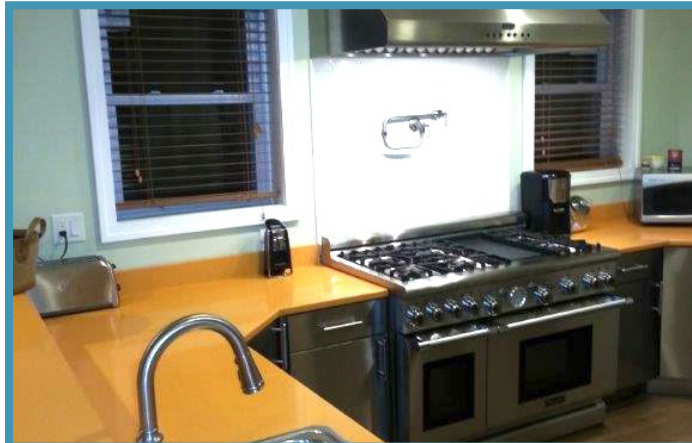
Women Aware's Safe House Kitchen