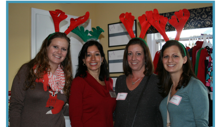
Holiday Gift Shop Volunteers

Women Aware’s Annual Holiday Gift Shop helped families celebrate the joy of the season! In 2012, 156 women and children participated in the event, which was supported by 66 community volunteers. In-kind gifts were donated by 102 generous community partners.