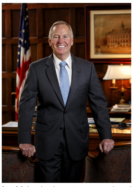
Jim Cahill Mayor of New Brunswick

Jim Cahill is the 62nd Mayor of the City of New Brunswick. He has served continuously as Mayor since 1991. During his tenure as Mayor, New Brunswick has experienced an unprecedented wave of growth and investment that has transformed this once declining industrial City into a thriving 21st Century Urban Center. Mayor Cahill spurred collaborations among the private sector, the city's